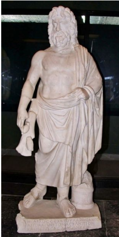
Figure 1. Statue of God Asclepius, Archeology Museum, Afyonkarahisar, Turkey

In Asclepeions, the healing centers of ancient world, sons of God Asclepius or his successors called as Asclepiads used to serve as priest physician, analyze dreams and apply cures (Lloyd, 1979; Gardner, 2017). Suggestion therapy was applied particularly to mental and psychosomatic disorders (somatoform disorders) after priests analyze the dreams of patients who incubated in abaton to have dreams (Israelowich, 2012; Harris, 2008). On the other hand, bodily diseases had been treated by thermal hydrotherapy, diet cures, physical exercises, regurgitation, clyster, phlebotomy (i.e. cupping, leech), various drug treatments and anaclasis diagnosis (Neuburger, 2016; Wilder, 1904; Kate, 2009; Guthrie, 1945; Carroll, 2016; Israelowich, 2012; Hamilton, 2016; Caton, 2014; McKenzie, 1914; Pausinas, 1875). Besides, surgical interventions had been applied to the cases required (Risse, 1999; Boehringer, 1969).